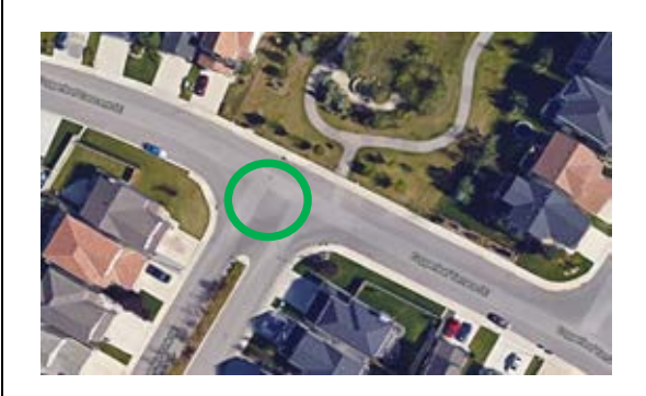
This is a great location because it satisfies all of the requirements. This location is residential, does not have a Calgary Transit route and the crossing can be avoided.