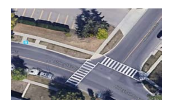
This Is not a suitable location for an intersection painting because it is a Calgary Transit route.

*Please note: The City may choose not to approve a location that meets some or all of these requirements if they are any safety concerns or for any other reasons that a location may not be suitable.