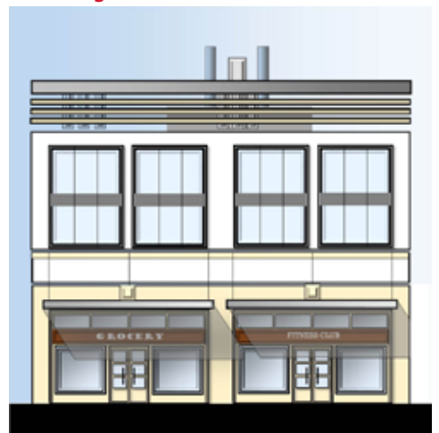
Partial or full screening of rooftop antennas minimizes visibility from a distance and from street level.