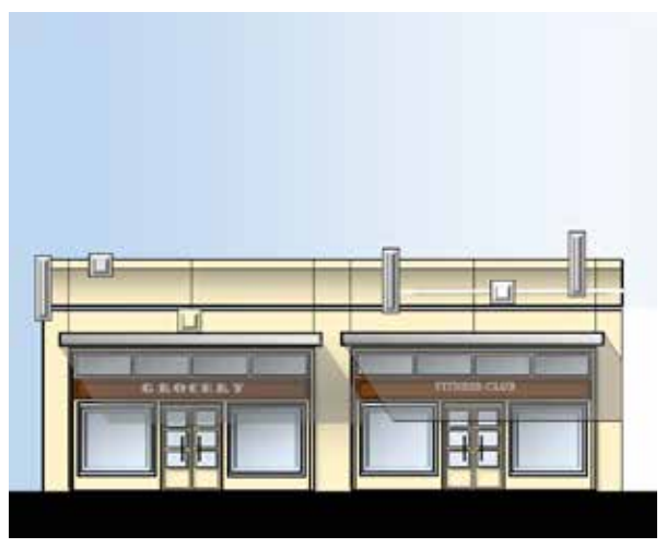
Disorderly application on the building façades and/or exposed wiring/conduit is discouraged.