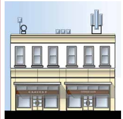
Films applied to antennas reflect the sky and minimize visibility from a distance.