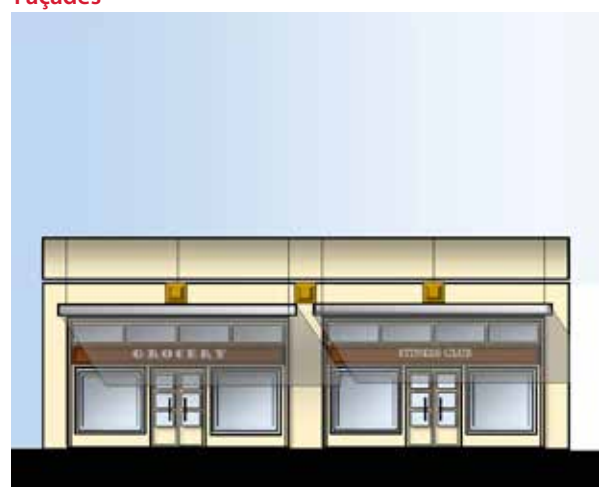
Orderly integration into the building façade with concealed wiring is encouraged.