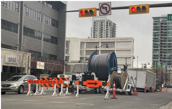
Looking south at transmission line work in Beltline west (10 Avenue).

Utility relocation work continued in the month of October within the Beltline and Downtown.