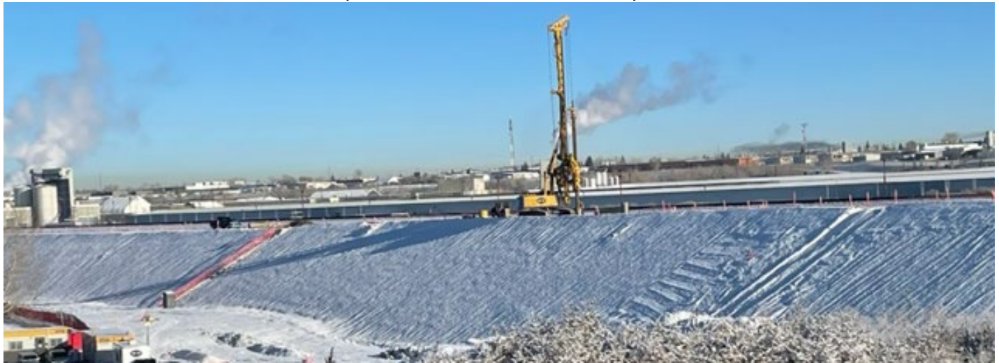
Looking east at the completed 78 Avenue diversion track embankment.

October was critical month for completing weather-dependent embankment construction work and Green Line worked with the contractor on an accelerated plan to expedite work by engaging another gravel pit and doubling the daily production and laying of gravel. As a result, the diversion embankments at 78 Avenue and the Pedestrian Tunnel area were completed at the end of October as planned.