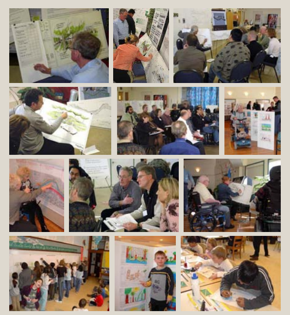
Many Calgarians have already had an opportunity to participate in this project

This landscape needs to place war within the context of history, while we need to understand the place of Memorial Drive within the context of the city.