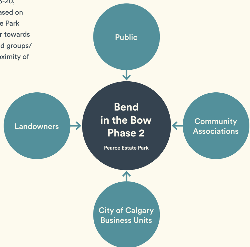
Figure 3: Bend in the Bow Phase 2 Engagement Network

A variety of engagement activities were deployed to reach out to stakeholders and the public, such as a stakeholder workshop (March 2016), online engagement (April 6-20, 2016), and in-the-park sounding boards (April 13-20, 2016). Key stakeholder groups were selected based on their current use of and interest in Pearce Estate Park and the adjoining green spaces along Bow River towards the Inglewood Bird Sanctuary. This also included groups/ governing bodies that currently own land in proximity of the project site.