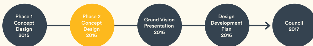
Figure 1: Bend in the Bow Timeline

Building on Phase 1, Phase 2 will continue with the vision of “a park that tells stories,” with a focus on balancing the core values of nature, culture and education. Phase 2 will include habitat enhancements and multi-use programming, incorporate active recreation opportunities, education planning, and celebrate the cultural history of the site.