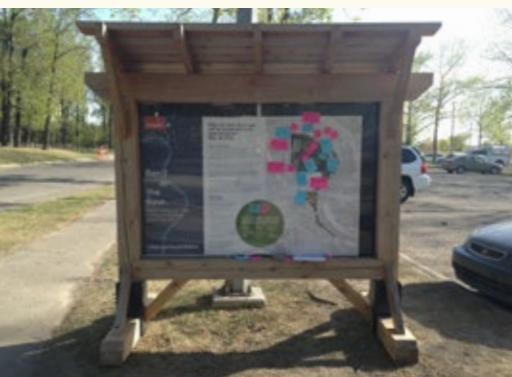
Sounding Board in Pearce Estate Park

I wish this could be... 265 comments received