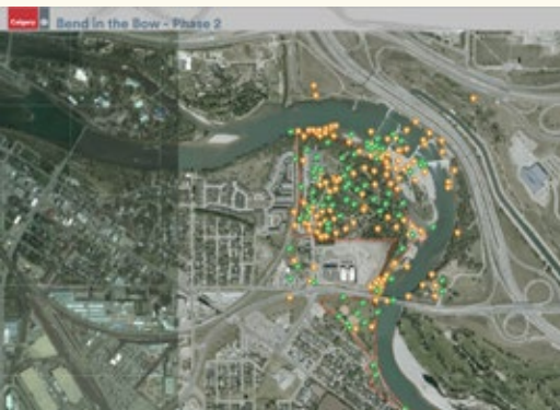
Online Mapping Tool

How do these ideas build on the values (nature, culture, education)?