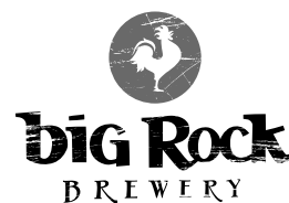
Commerce Big Rock Brewery