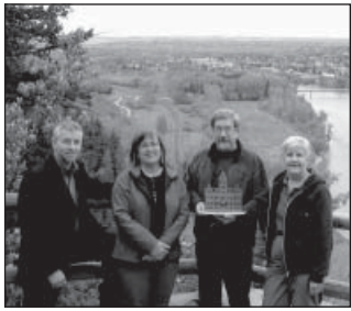
Not for Profit Organization Edworthy Park Heritage Society